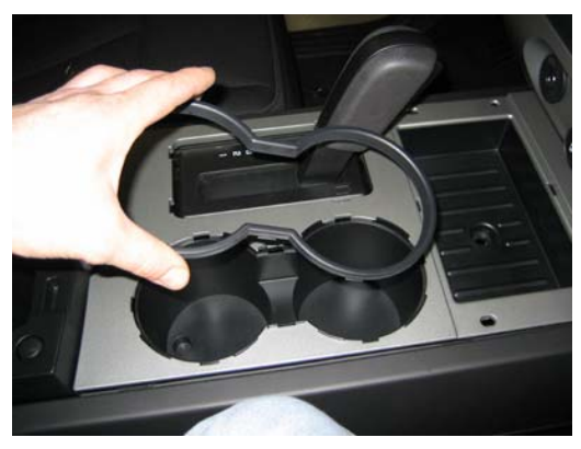
Remove trim from around the cup holders